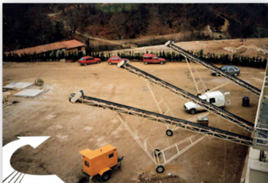
Installation of TTL 's for treatment of aggregates.

Equipment TTL with belt Board type and totally covered for elevating the product.