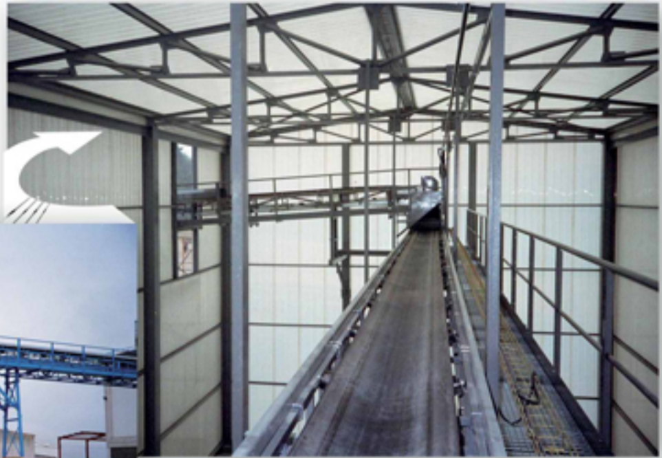
Detail of tripper for unloading and walkway on conveyor TTL.