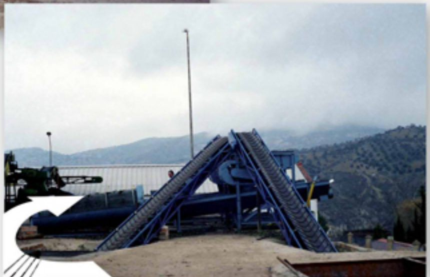
Set of TTL's conveyors for agricultural sector.