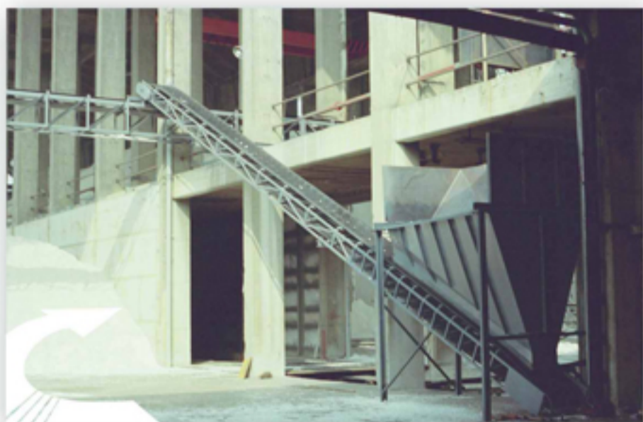
TTL under a hopper feeding a conveyor type TCL.

Installation of TTL 's joined for conveying boxes and packages.