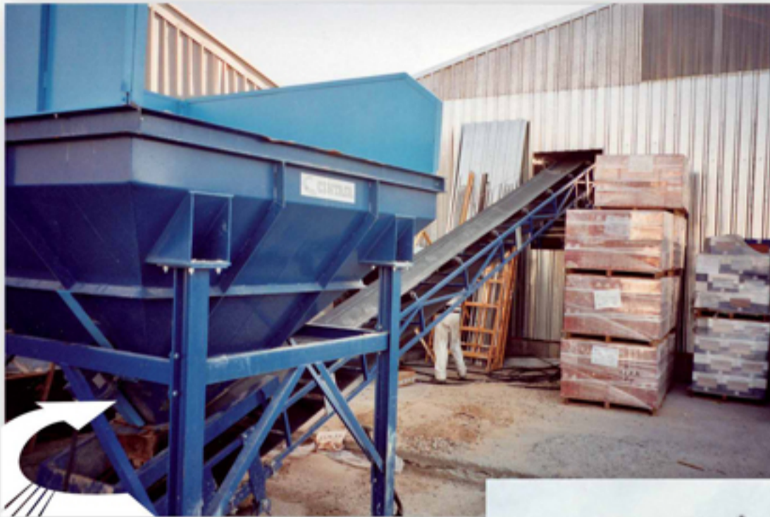
Conveyor TTL for building sector.